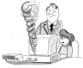
"That's usually not a good sign."